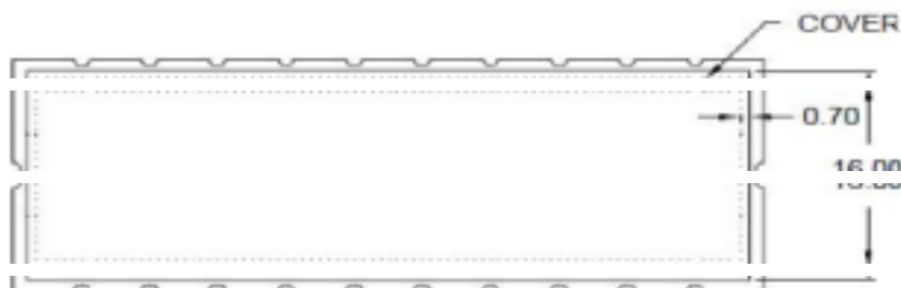
TOP VIEW WITH COVER